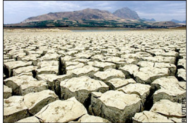
Biblical droughts, floods, plagues and extinctions?

So to the scare. First, the UN implies that carbon dioxide ended the last four ice ages. It displays two 450,000-year graphs: a sawtooth curve of temperature and a sawtooth of airborne CO 2 that's scaled to look similar. Usually, similar curves are superimposed for comparison. The UN didn't do that. If it had, the truth would have shown: the changes in temperature preceded the changes in CO 2 levels.